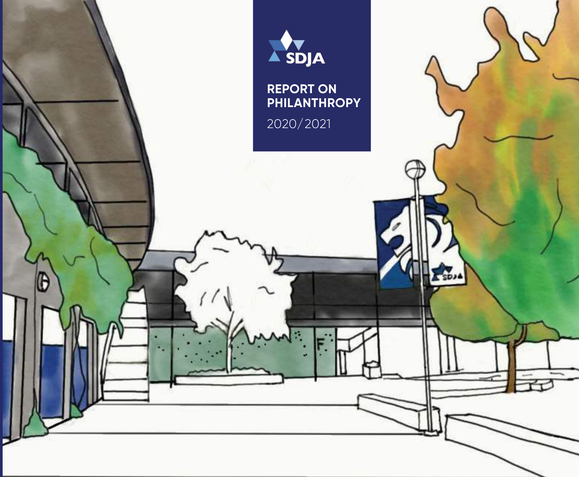
Cover art by an SDJA Maimonides Upper School student